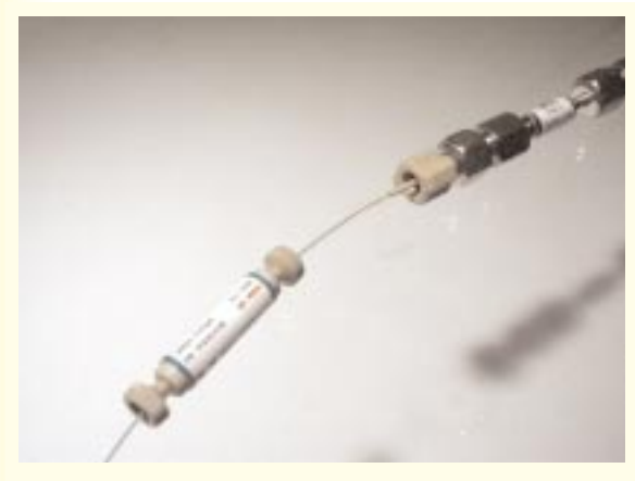
10x1.0mm Piccolo being used as a guard column for a 50x1.0mm analytical microbore column.

In addition to analytical microbore applications Piccolo columns are ideal guards for protecting longer microbore HPLC columns as illustrated below.